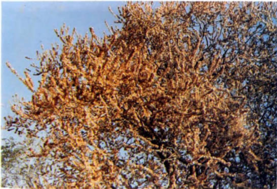
Holoptelea integrifolia (Roxb.) Planch.