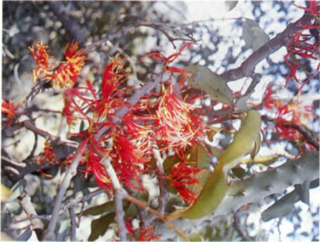
Dendrophthoe falcata (L. f.) Etting.