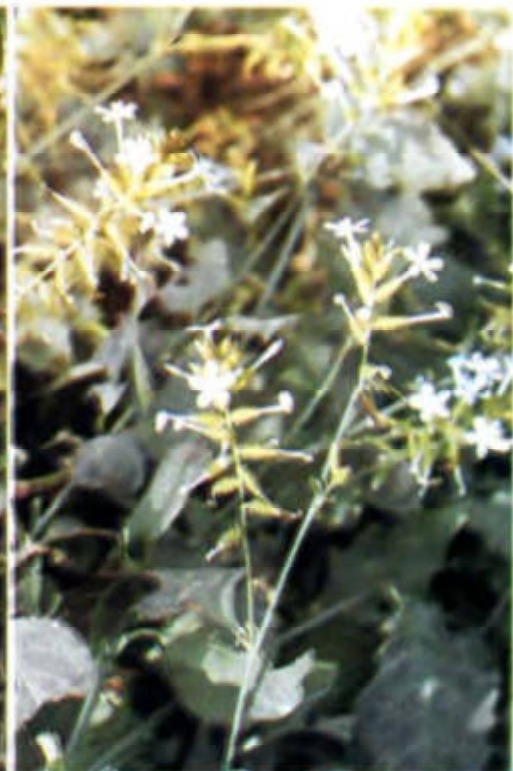
Plumbago zeylanica L.