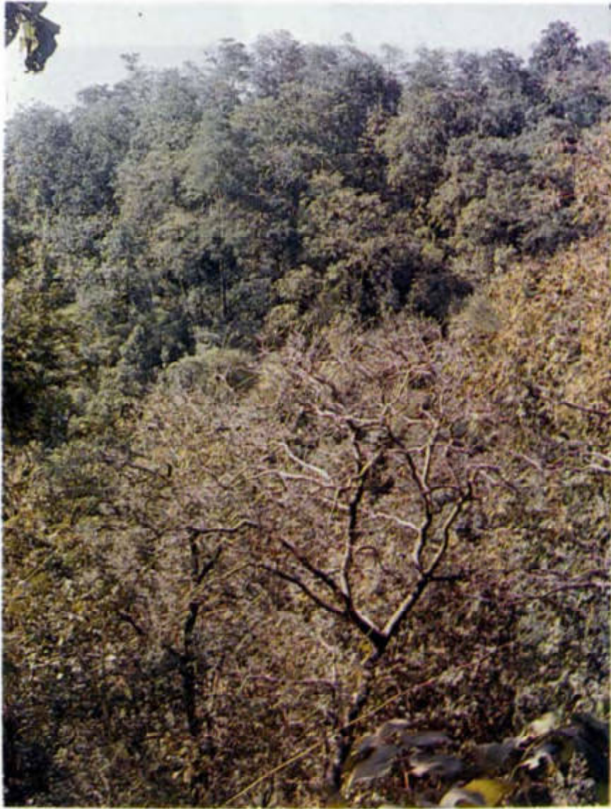
Dry mixed deciduous forest