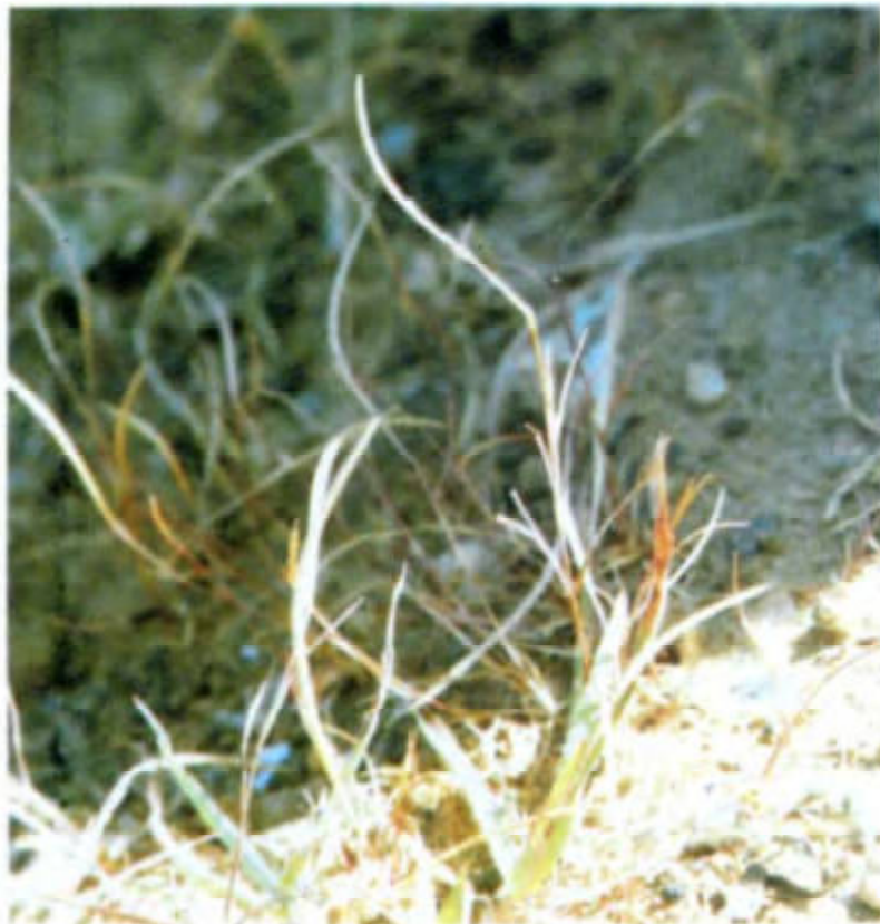
Microchloa indica (L. f.) P. Beauv.