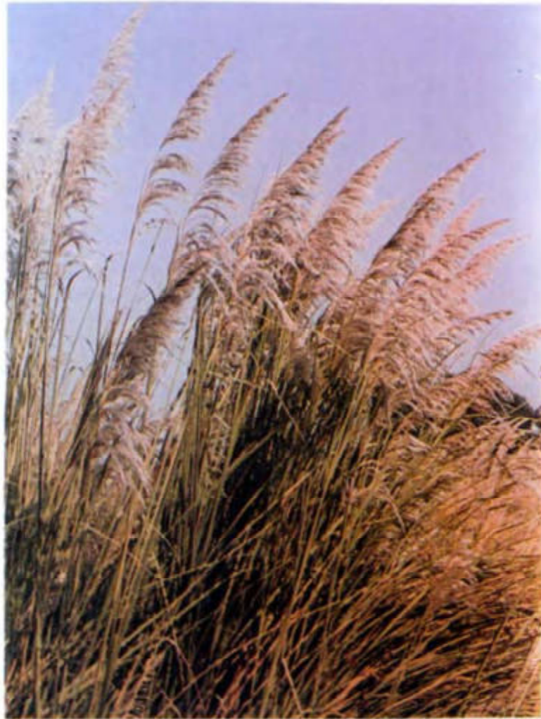
Saccharum spontaneum L.