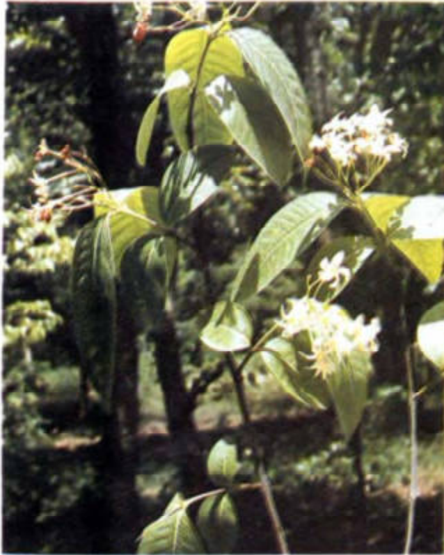
Holarrhena pubescens (Buch.-Ham.) Wallich ex G. Don