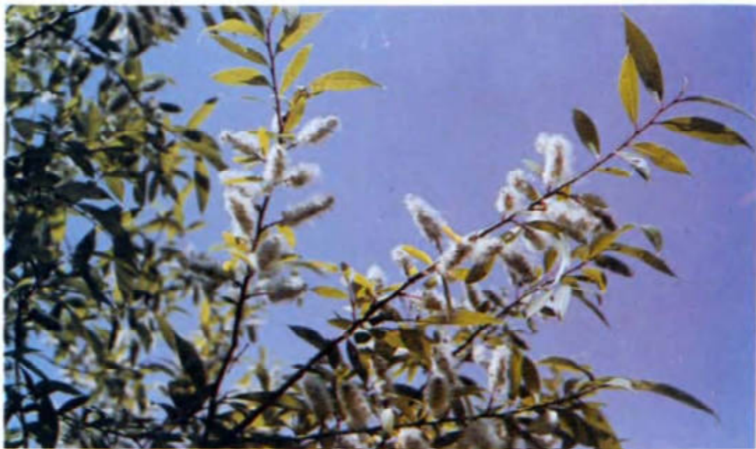
Salix tetrasperma Roxb.