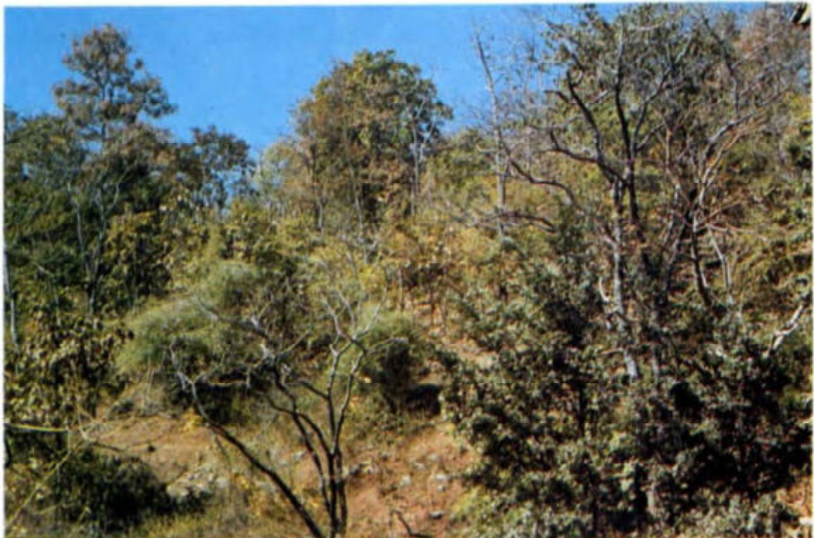
Dry mixed deciduous forest