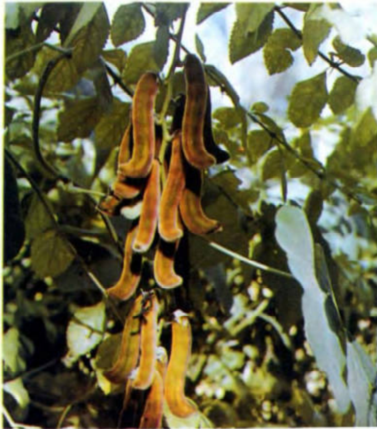
Mucuna pruriens (L.) DC.