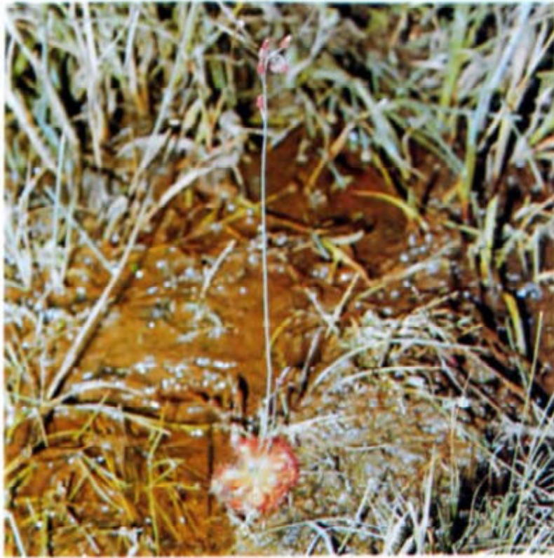
Drosera burmanni Vahl