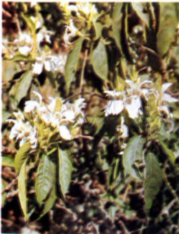
Adhatoda zeylanica Medik.