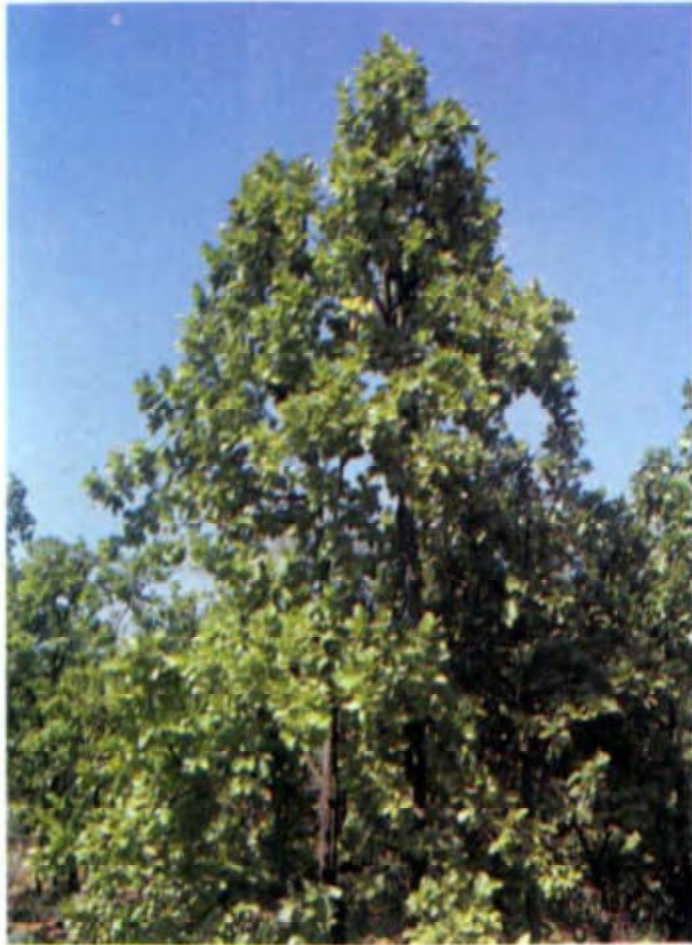
Shorea robusta Roxb. ex Gaertn. f.