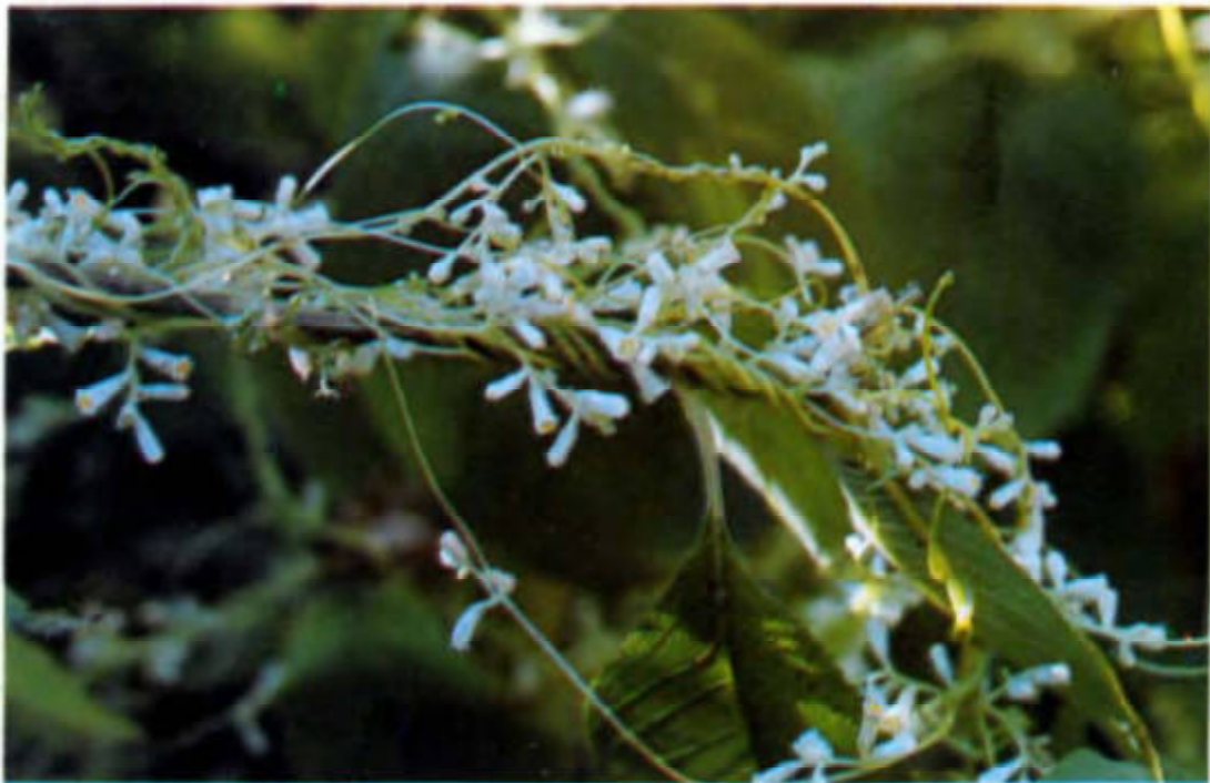
Cuscuta reflexa Roxb.