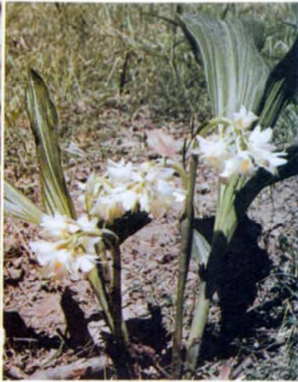
Mallotus philippensis (Lam.) Muell. Arg. Geodorum densiflorum (Lam.) Schlechter