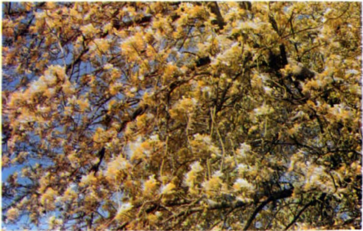
Crateva adansonii DC. subsp. odora (Buch.-Ham.) Jacobs