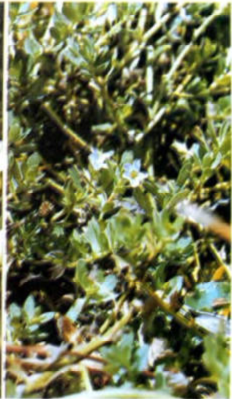
Bacopa monnieri (L.) Wettst.