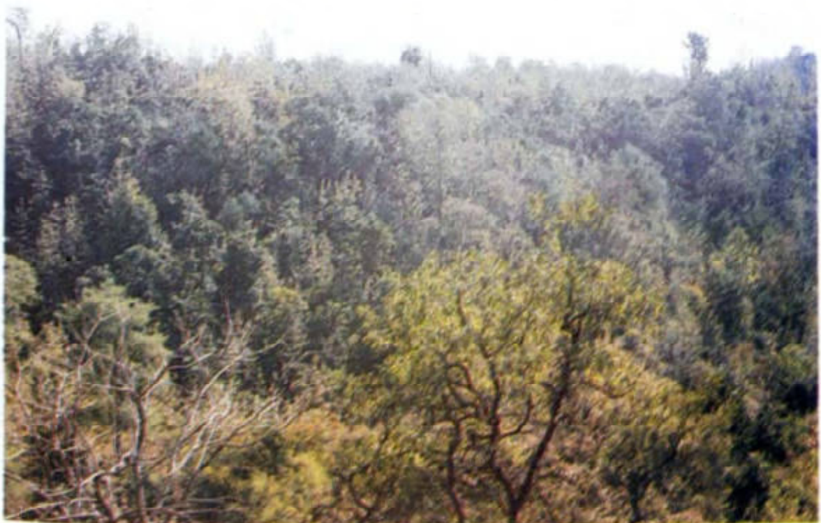
Moist mixed deciduous forest